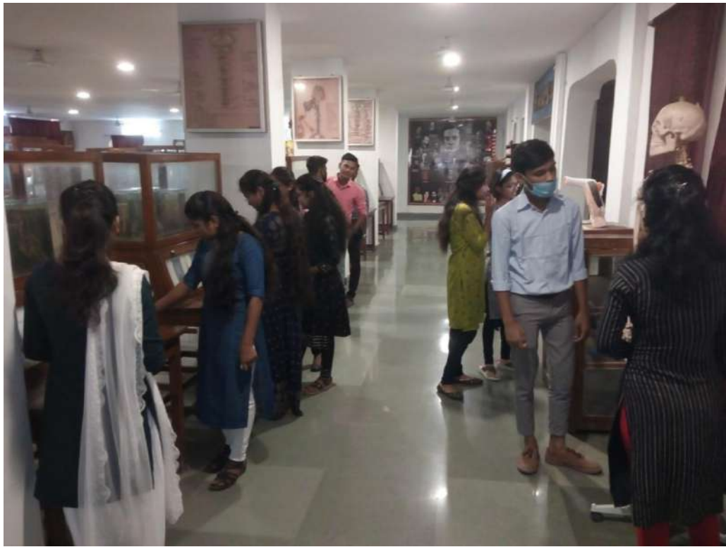
Free Museum - Sharing of University resources for local community