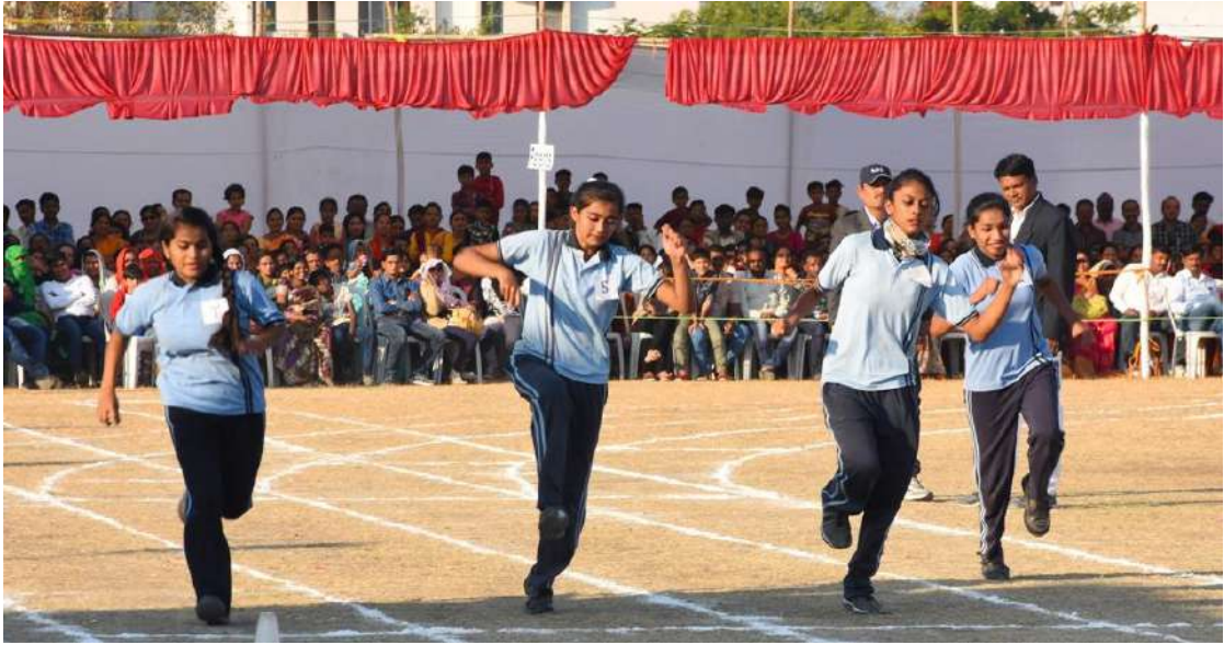
Free Sport Ground facility shared with Local communities.