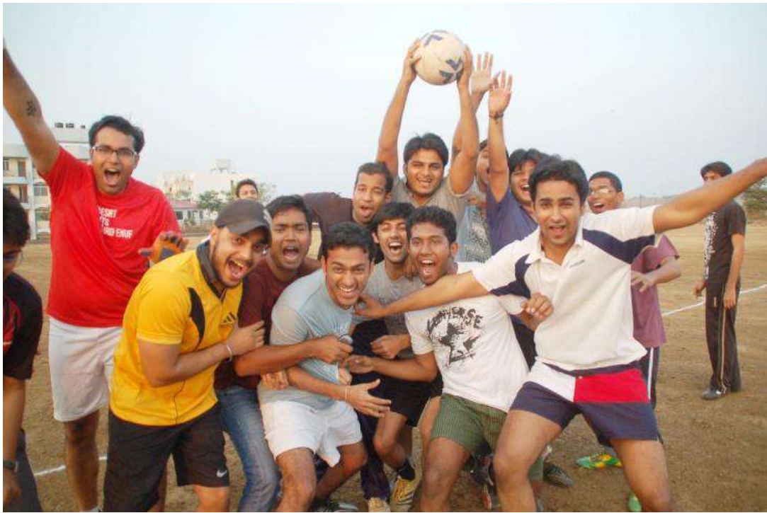
Free Sport Ground facility shared with the Local community