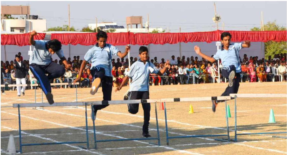
Free Sport Ground facility shared with Local communities.