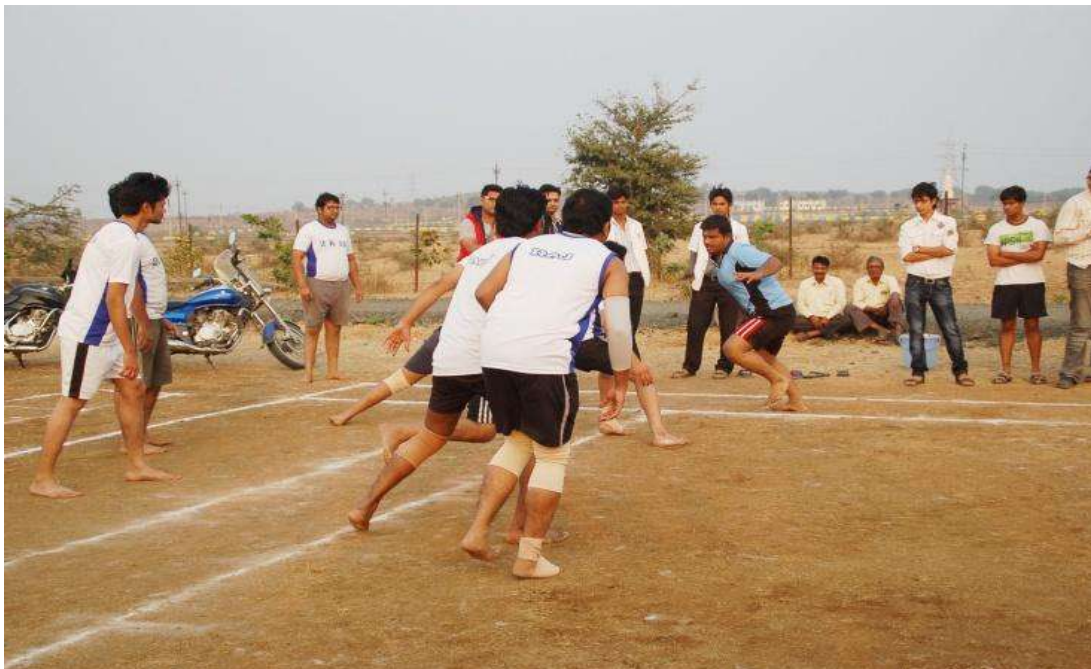
Free Sport Ground facility shared with Local communities

The said shared facilities are well appreciated by the Local Community.