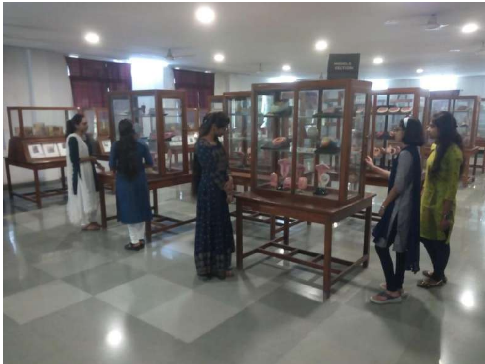
Free Museum - Sharing of University resources for local community